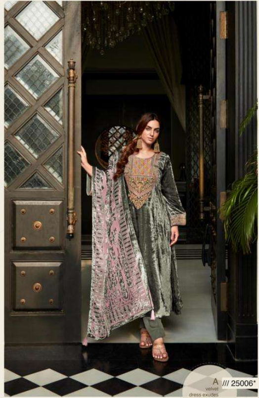
A /// 25006* velvet dress exudes elegance and luxury