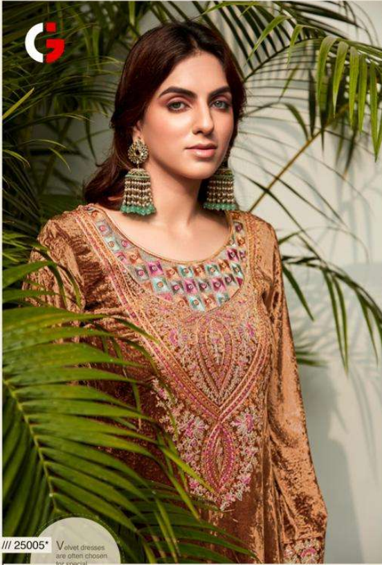
/// 25005* Velvet dresses are often chosen for special occasions like weddings and galas.