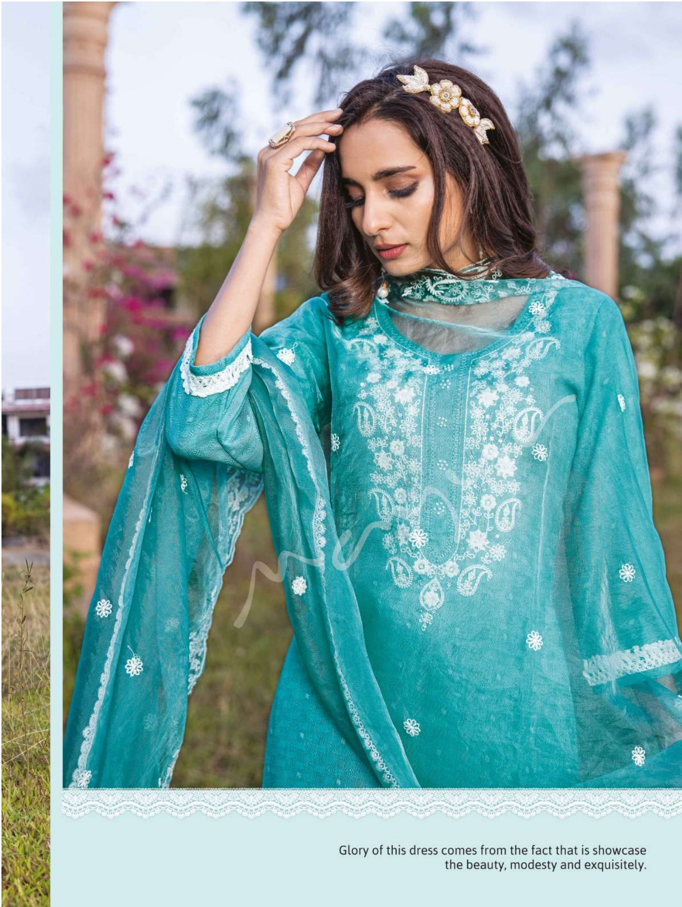
Glory of this dress comes from the fact that it showcases the beauty, modesty and exquisiteness.