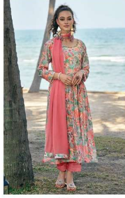
— 40045 —