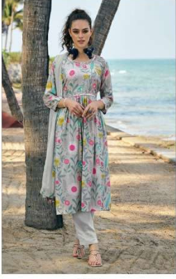
— 40041 —