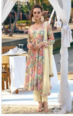
— 40042 —