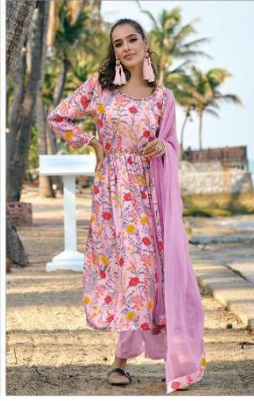
— 40044 —