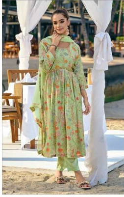
— 40043 —