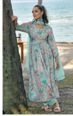
— 40046 —