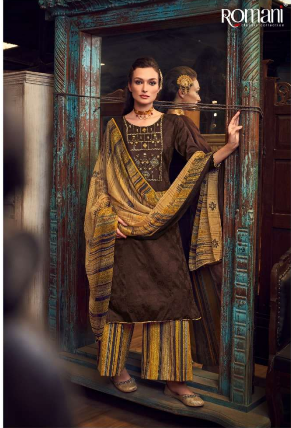
A WOMAN'S DRESS SHOULD BE LIKE A BARBED WIRE FENCE. SERVING ITS PURPOSE WITHOUT ABSTRACTING THE VIEW. | 1065-005