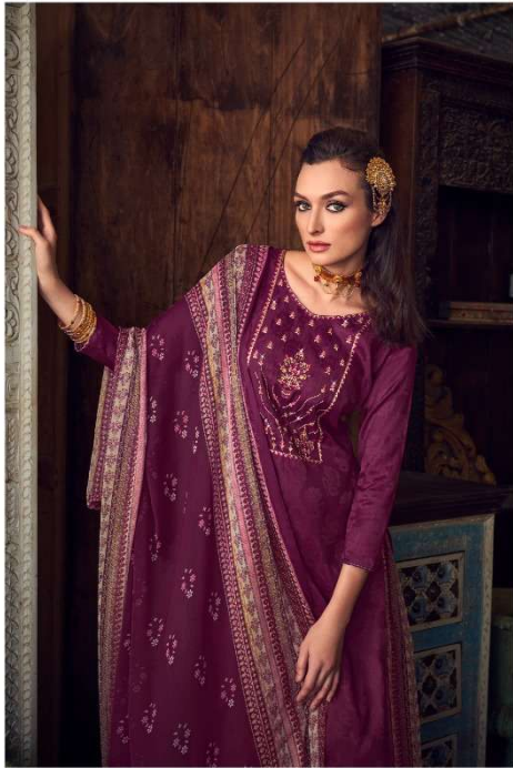
CELEBRATE DESIGN OUR ENHANCED STYLE AND FASHION PATTERNS. DEFINE TRUE CONFIDENCE IN WOMEN. | 1065-001