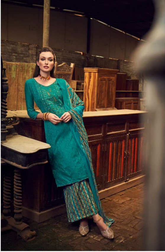
1065-003 | LOOKING TO TRANSFORM YOUR BODY AND RAISE YOUR ENERGY LEVEL? HEAL YOUR MIND, BODY AND SOUL WITH OUR NEW COLLECTION.