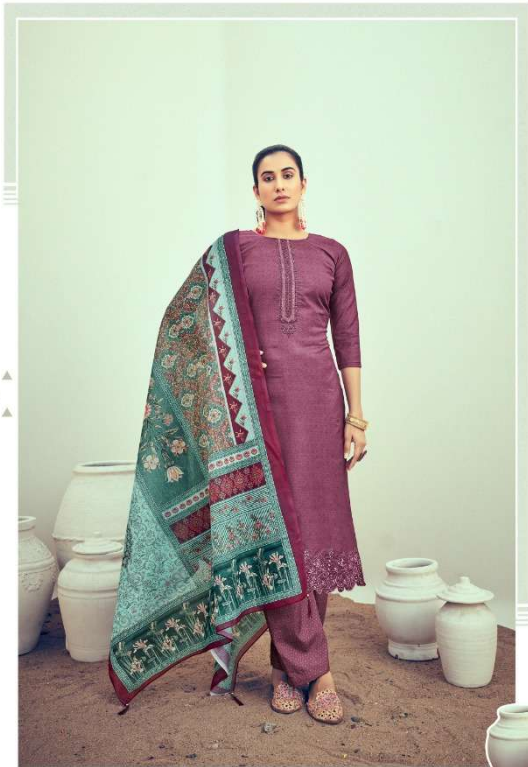
FANTASY KEEP IT SIMPLE 157-001