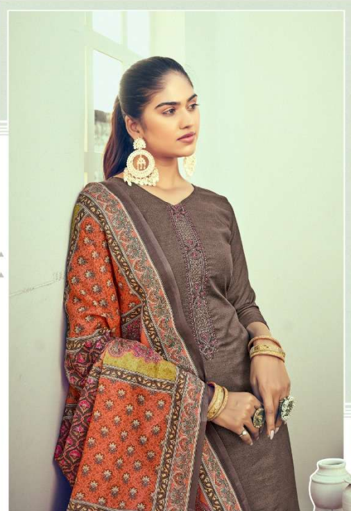
ORDINARY STYLE IS VERY PERSONAL