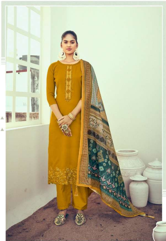
FANTASY KEEP IT SIMPLE 157-004