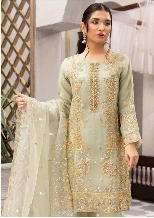
P - 10004-A