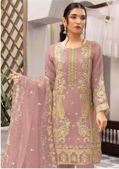
P - 10004-B