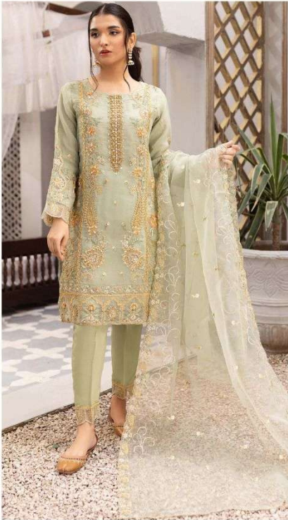
P - 10004-A