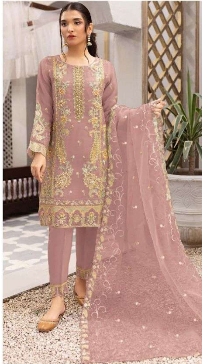
P - 10004-B