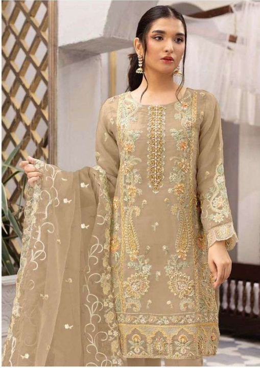
P - 10004-C