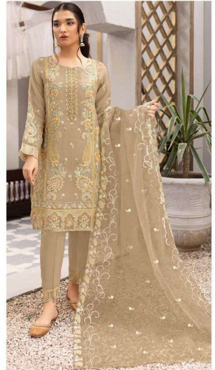
P - 10004-C