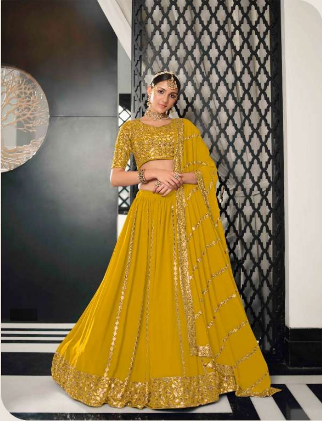
Peeping up bright hues on an eerie palette with a touching of delicate faded motifs – it's just the old traditional charm. #2153