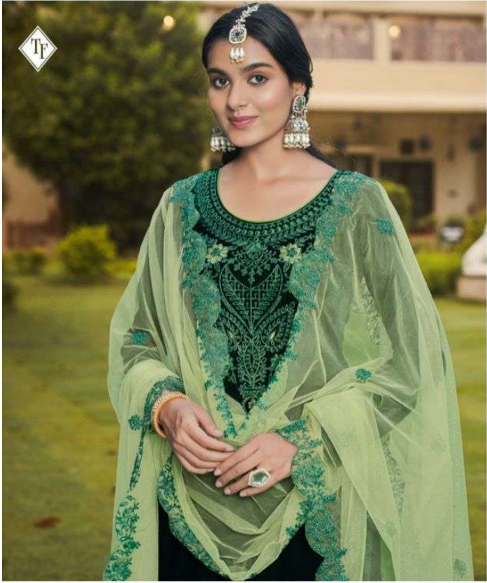
Fuel your love for Indian ethnicity by adorning this magnificently crafted designer saree conch. - labeled with golden motif.