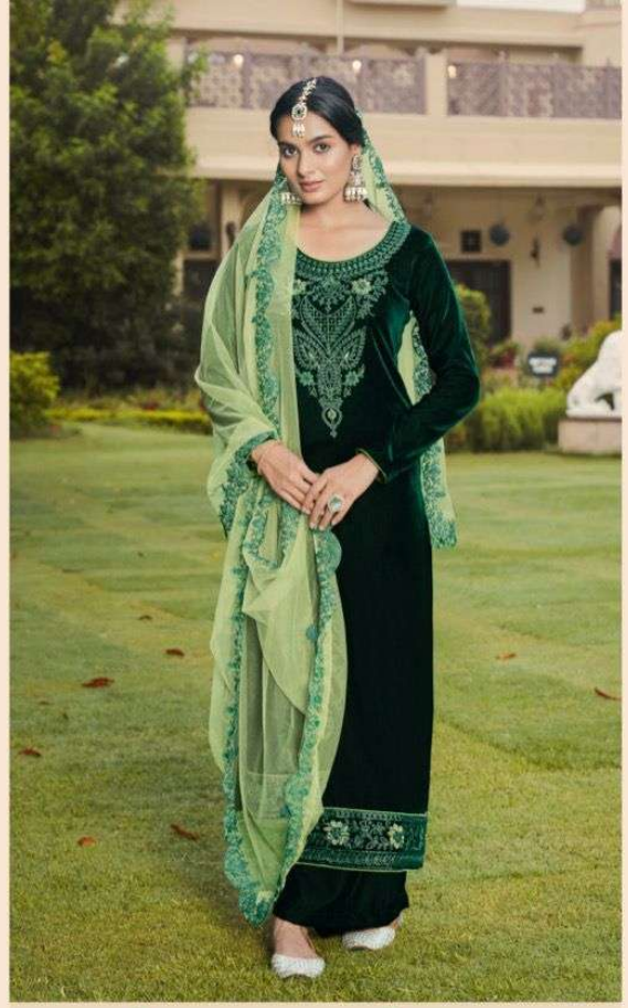
• THE TRADITIONAL SIX YARDS • -3703-