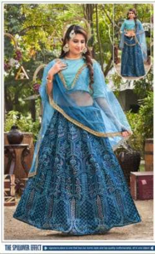
THE SPILLOVER EFFECT