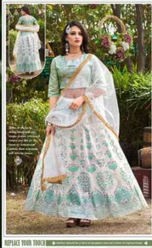
REPLACE YOUR TOUCH