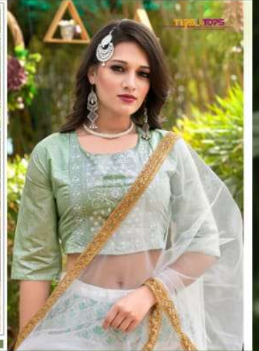
TIPS & TOPS