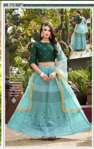
LOOK STYLE BEAUTY