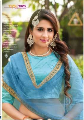
TIPS & TOPS