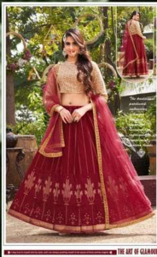
THE ART OF GLAMOUR