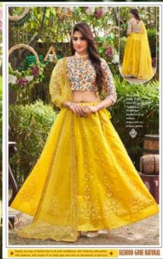
FASHION GONE NATURAL