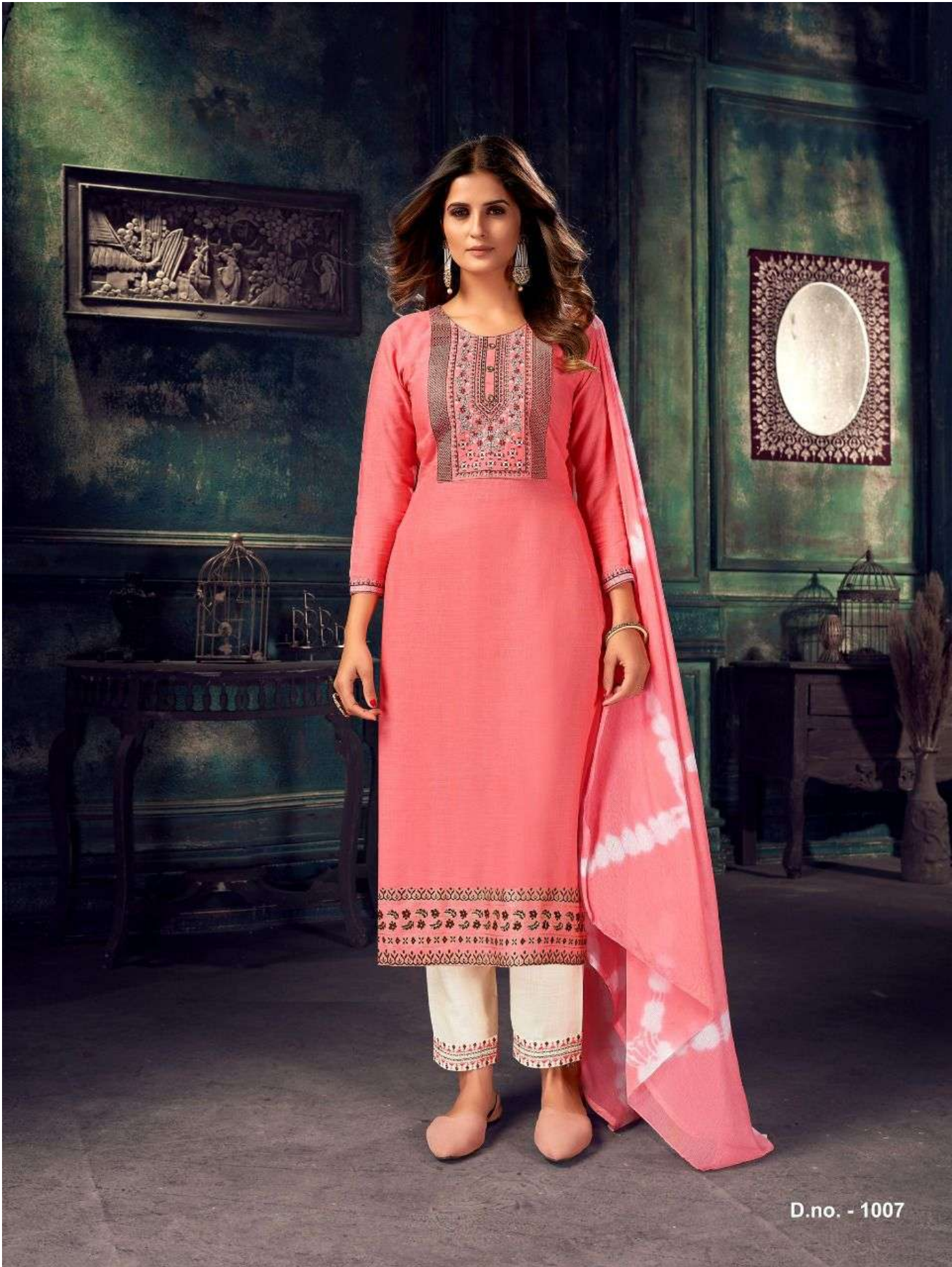
D.no. - 1007