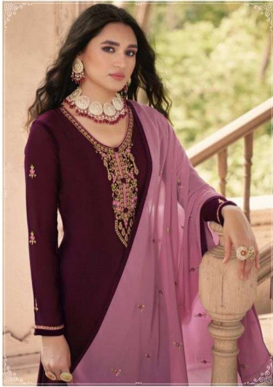
MATCHLESS STYLE, AMAZING WORK DETAILS AND A DASH OF TRADITION. WHAT ELSE YOU NEED TO FLAUNT ON THIS FESTIVE SEASON?