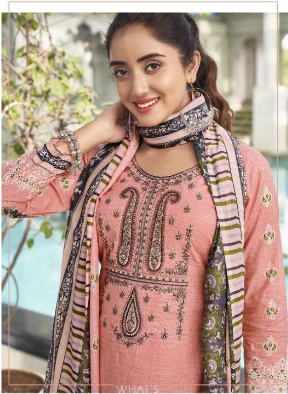
WHAT'S NEW "Style is something each of us already has, all we need to do find it."