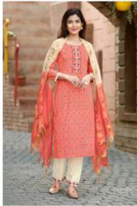
D. NO- 3008