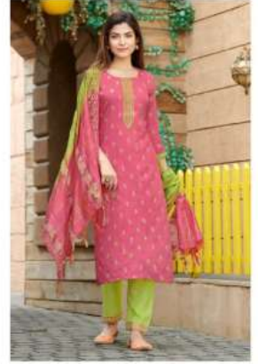
D. NO- 3002