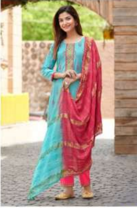
D. NO- 3005