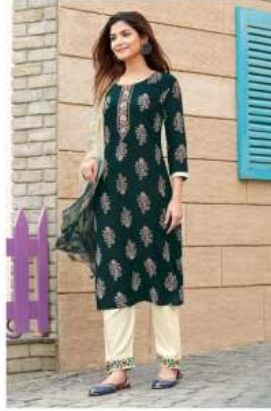
D. NO- 3001