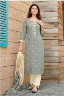
D. NO- 3007