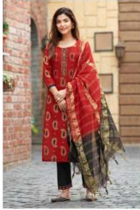
D. NO- 3006