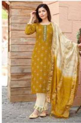
D. NO- 3003