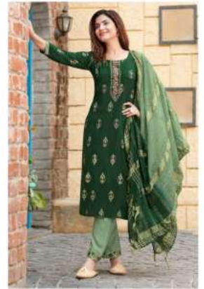
D. NO- 3004