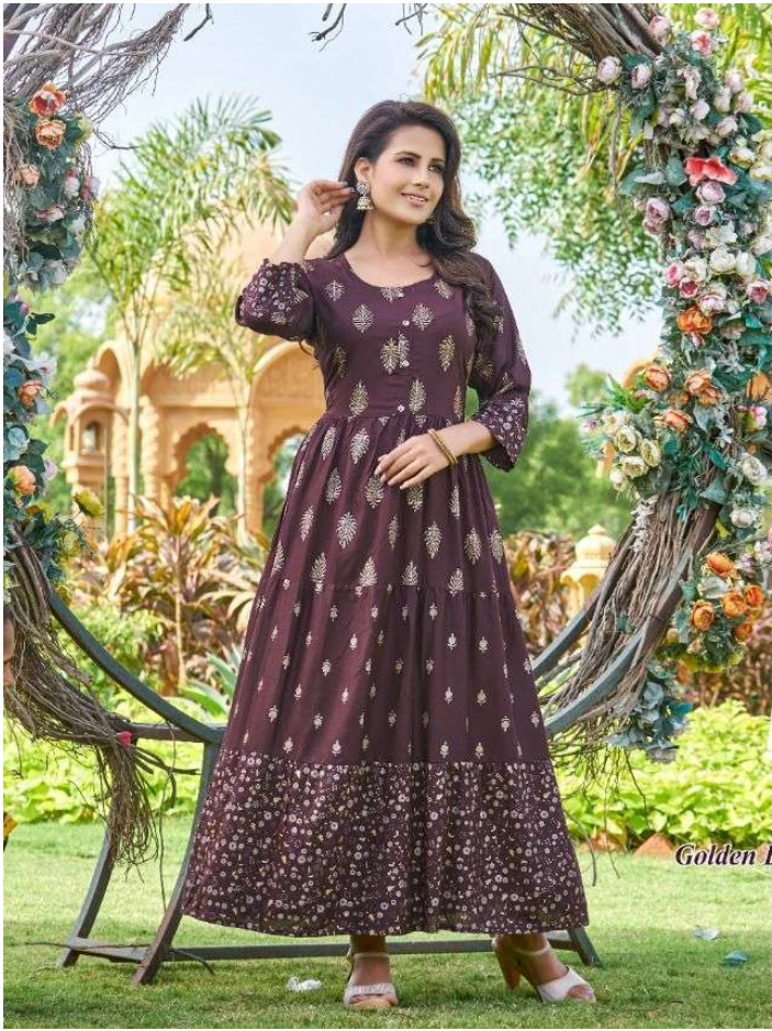
Golden Beauty 05