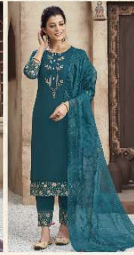
SHAK - 62