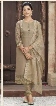
SHAK - 65