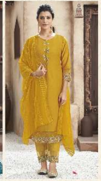
SHAK - 63