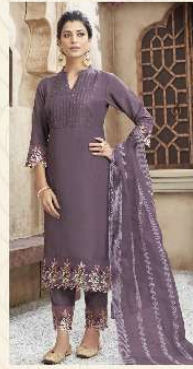
SHAK - 61