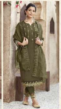
SHAK - 66