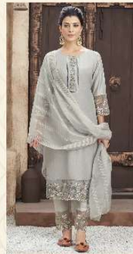
SHAK - 64