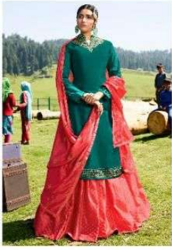
• 21301 •