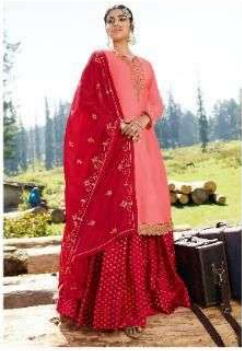
• 21303 •