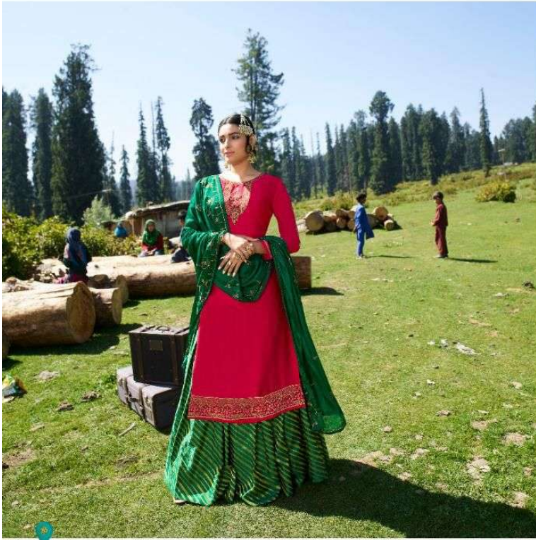
The soulful art