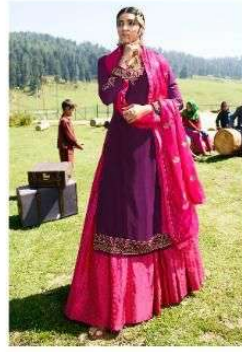
• 21306 •