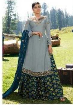
• 21307 •