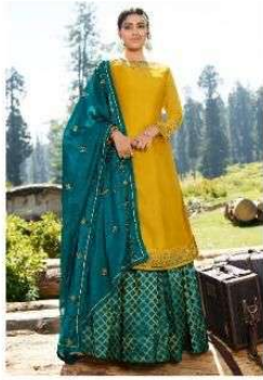
• 21304 •