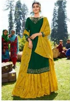
• 21302 •