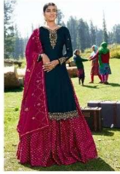
• 21305 •