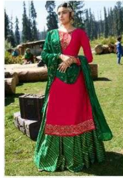
• 21308 •