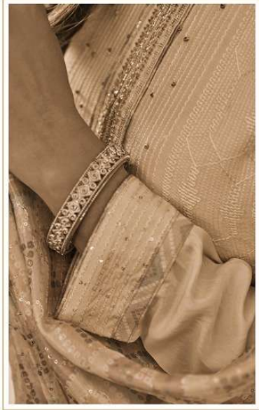
D.No : 3212