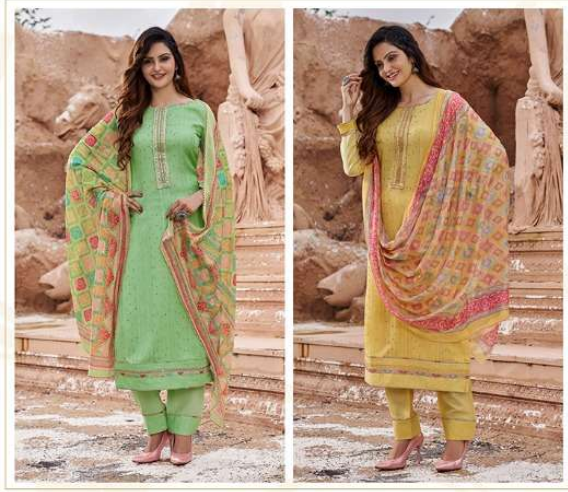
D.No : 3211