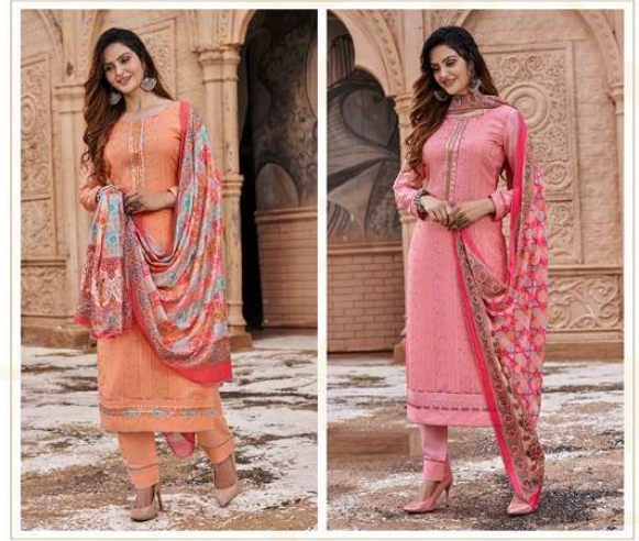
D.No : 3213