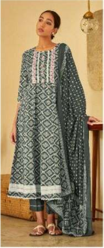
K - 201