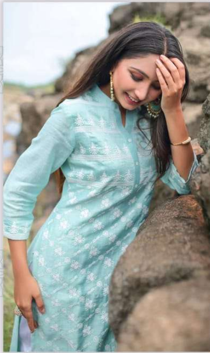
SHQV01 Sea Green - Dyed in a calming hue with embroidery, perfect for everyday wear.