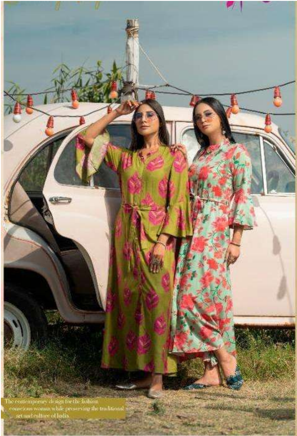
The contemporary design for the fashion-conscious women while preserving the traditional art and culture of India.