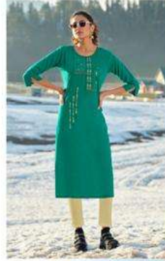
✦ 1007 ✦