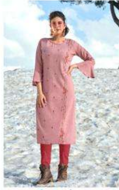
✦ 1002 ✦