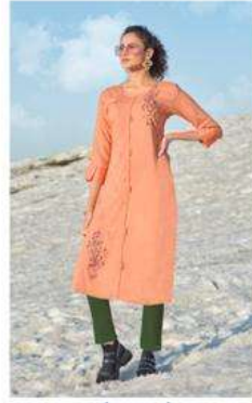
✦ 1005 ✦