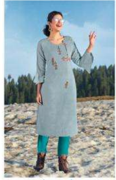
✦ 1006 ✦