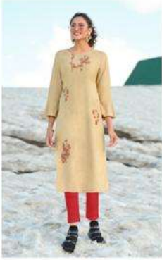
✦ 1003 ✦