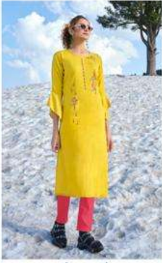
✦ 1001 ✦