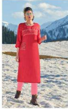
✦ 1004 ✦